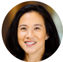
Angela Duckworth, PhD