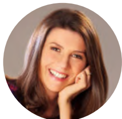
Lea Waters, PhD

What do we do when kids just don't "feel like" doing homework, chores, or other responsibilities? The world-renowned expert on procrastination enlightens us with a tool-packed interview!